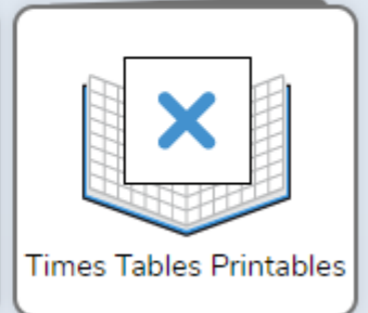
Table Toons - Great for learning individual times tables.

Monster Multiplication - Involves all times table facts.